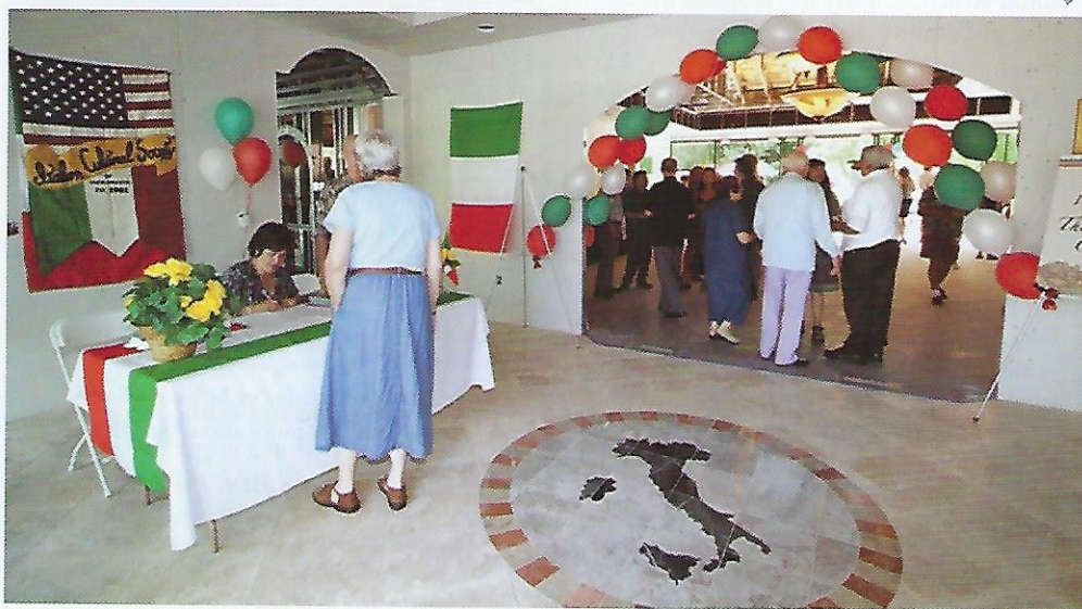
The entryway welcomes all at The Italian Center, adorned with a masterpiece of Tuscan marble courtesy of Cortopassi Tile & Stone. The Center is scheduled for completion this summer.

To find out more about The Italian Cultural Society in Sacramento, call 916-482-5900 or log on to www.italiancenter.net .