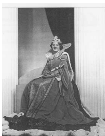
Queen Isabella, Columbus Day 1939, Richmond, California

The Discovery of America by Columbus is celebrated as a national holiday with parades in many cities across the United States. The origins of the holiday began in the Italian communities across the United States and evolved from an ethnic holiday to a national commemoration. Born in Genoa, Italy, Columbus is treated as a heroic figure among Italian Americans. While there is a concerted movement to eliminate Columbus Day from the public schools and the public square, the fact remains, when Columbus discovered America, it stayed discovered and led to the largest movement of a single people – the Italians - from one continent to another in history. Join us for this video documentary on the life and voyages of Columbus. At the Italian Center. Free and the public is invited.