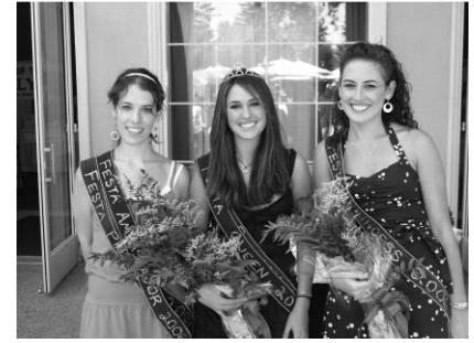
Festa Queen Pageant