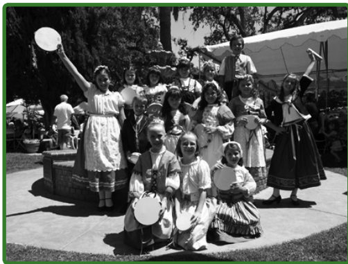
Bambini Dancers at Festa Italiana 2011