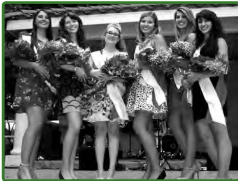
(Above) Festa Italiana Queen scholarship pageant. (Below) Bambini dancers performed at Festa Italiana 2012.