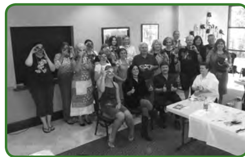
Mask Making Workshop at Italian Center

Help us preserve and pass on this valued and important cultural heritage by making a donation to the Italian Center Fund or becoming a member of the Italian Cultural Society. Donations and membership are tax deductible.