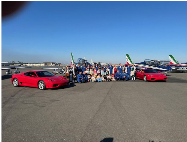
PHOTOS ABOVE & BELOW: Italian Cultural Society Folk Dancers greet the legendary Italian Air Force acrobatic pilots, the Freccie Tricolore, upon their arrival at Mather airfield in Sacramento, California on July 9, 2024.