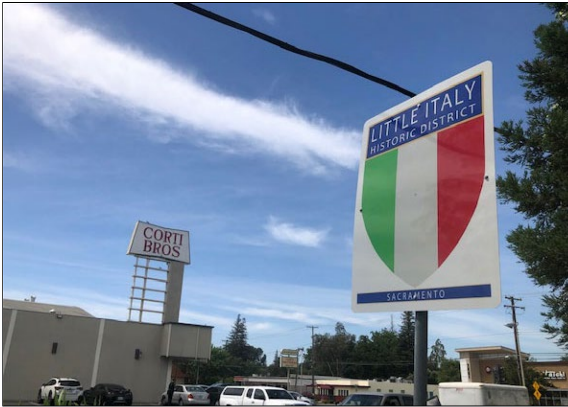
PHOTO ABOVE: LITTLE ITALY in Sacramento! The new signs are up! This sign is located on 59 th street across from Corti Brothers near the 59 th Street/Highway 50 off ramp.