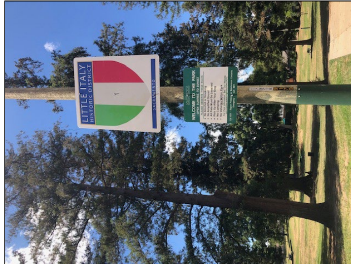
PHOTO BELOW: LITTLE ITALY in Sacramento! East Portal Park at Rodeo Drive and M Street, between Folsom Blvd. and J Street.