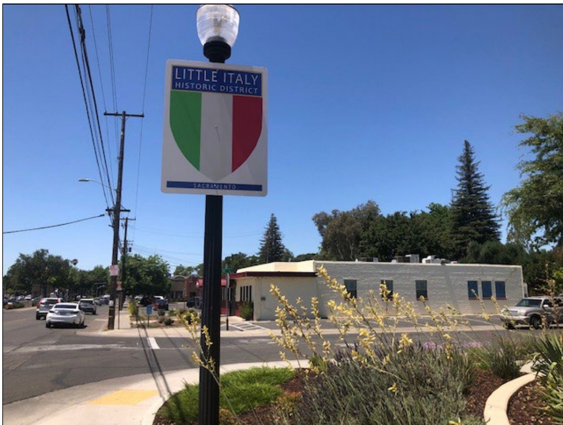
PHOTOs ABOVE: LITTLE ITALY in Sacramento! This sign is located at 58th Street and Folsom Blvd.