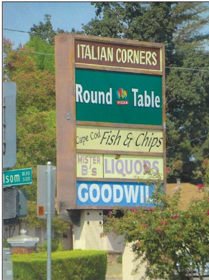
PHOTO ABOVE: The Italian Corners Shopping Center at 51st Street and Folsom Blvd.