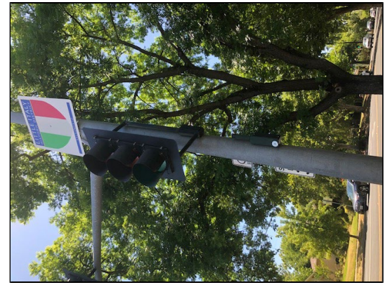
PHOTO ABOVE: LITTLE ITALY in Sacramento! Sign on left is located at 48th Street and J Street, and the sign on the right is located at 57th Street and J Street.